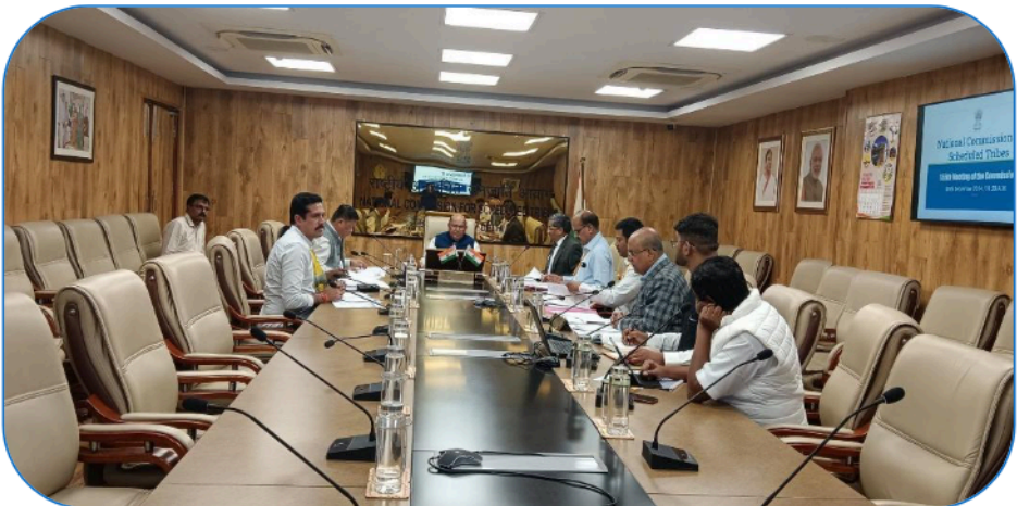
Shri Antar Singh Arya, Hon'ble Chairperson, NCST chairing the 155 th Meeting of the Commission along with Hon'ble Members and Officers of NCST