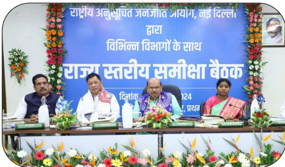
Review of constitutional safeguards for Scheduled Tribes in the State of Jharkhand by the team of NCST led by Shri Antar Singh Arya, Hon'ble Chairperson held on 30.08.2024

The National Commission for Scheduled Tribes has been set up with effect from 19 February 2004 by amending Article 338 and by inserting a new Article 338A in the Constitution through the Constitution (89 Amendment) Act, 2003, which inter-alia, enjoins upon the Commission to oversee the implementation of various safeguards provided to Scheduled Tribes under the Constitution or any other law for the time being in force or under any other order of the Govt. and to evaluate the working of such safeguards. The Commission comprises a Chairperson, a Vice-Chairperson and three full-time (including one lady) Members.