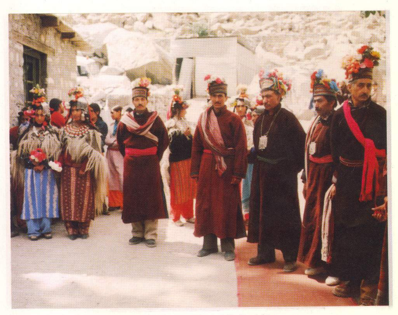
Drokpa Tribe of Darchik, Ladakh