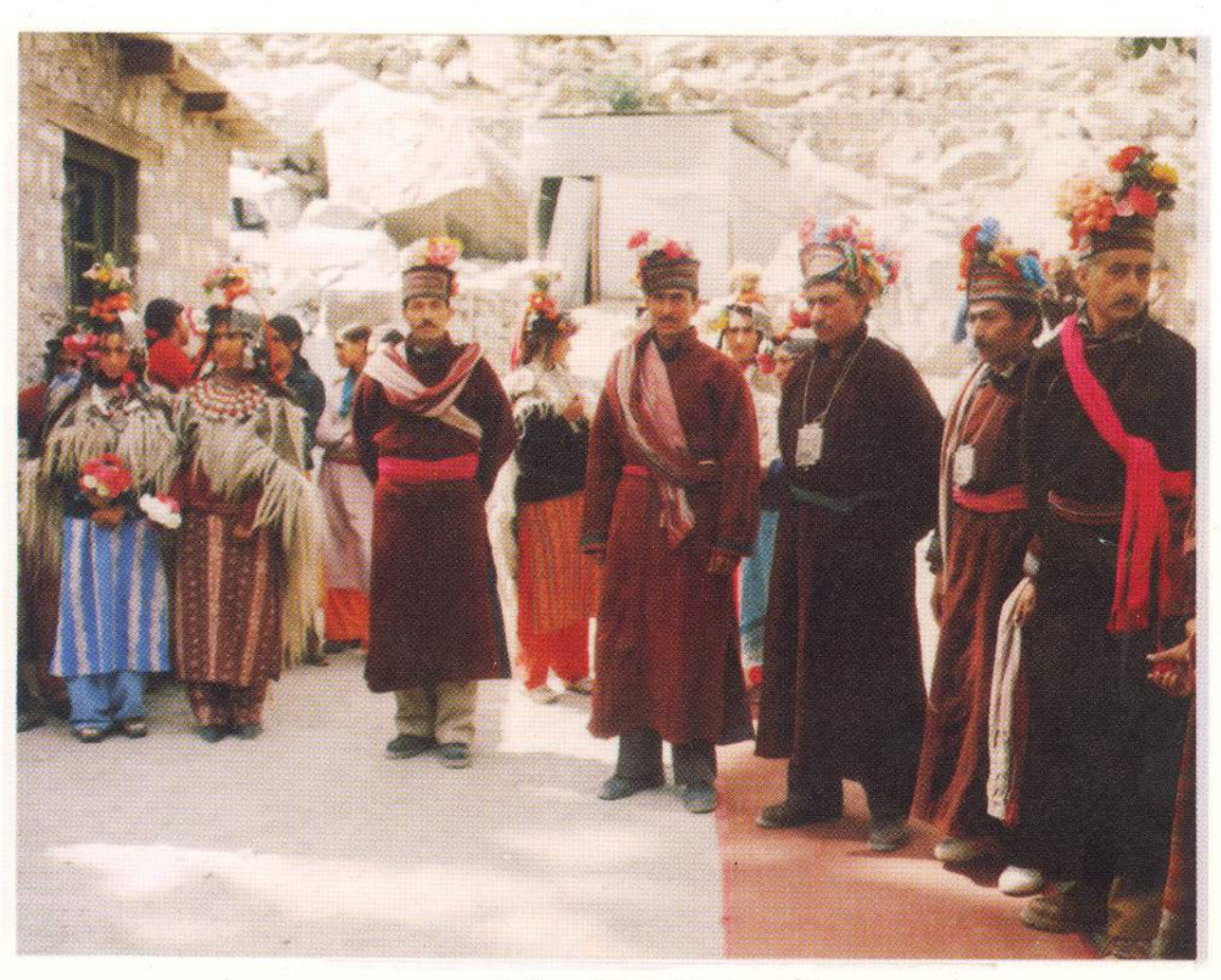
Drokpa Tribe of Darchik, Ladakh